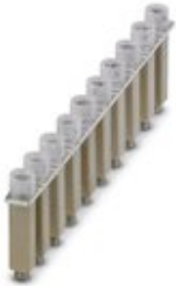
Fixed bridge, pitch: 9 mm, number of positions: 10, color: silver

Please be informed that the data shown in this PDF Document is generated from our Online Catalog. Please find the complete data in the user's documentation. Our General Terms of Use for Downloads are valid ( http://phoenixcontact.com/download )